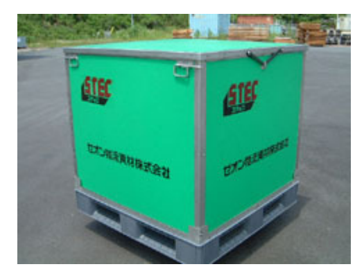
STEC-NL S Type Assembled container