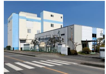
Zeon Opto Bio Lab Co., Ltd.

The predecessor of Zeon Opto Bio Lab, which was established in April 2019, was the Optes Inc. Sano Plant. Zeon Opto Bio Lab was established by spinning off the Sano Plant, which performs injection molding, from Optes, a subsidiary that performs manufacture of cycloolefin polymer (COP) processed products.