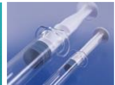
Medical device materials