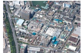
Aerial view of Kawasaki Plant

Established in 1959, Kawasaki Plant was the first plant in Japan to mass-produce synthetic rubber. It manufactures heat- and oil-resistant synthetic rubber used in automobile engine peripheral components. Synthetic latex is used in products such as rubber gloves, cosmetic sponges, and non-woven fabric. Kawasaki Plant produces many relatively high-value-added products in small quantities.