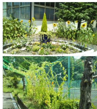
Greening campaign for plant grounds by growing "green curtains" led by the MD Committee