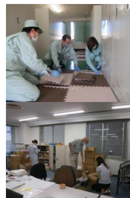
Improvement activities led by the MD Committee and Taimatsu (Torchlight)