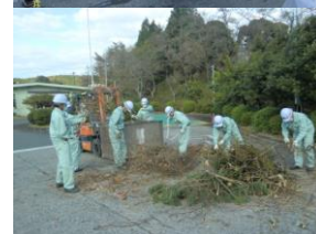
Neighborhood clean-up activities