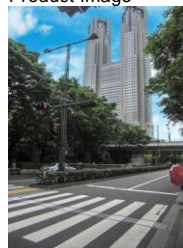
Pedestrian crossing with guidance markings for people with visual impairments