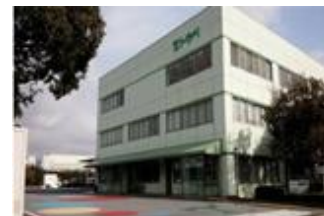
Tohpe Head Office

We were established as Toa Paint K.K. in 1915. We became a member of the Zeon Group in 2013. We manufacture and sell various types of paint, and operate a chemicals business based on acrylic rubber. We are participating in a project to manufacture powder paint in Vietnam, and are supplying stable quantities of products to the domestic market. We also constructed a plant in Thailand to manufacture functional coatings, and operations began in FY2019.