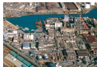
Aerial view of Kawasaki Plant

Established in 1959, Kawasaki Plant was the first plant in Japan to mass-produce synthetic rubber. It manufactures heat- and oil-resistant synthetic rubber used in automobile engine peripheral components. Synthetic latex is used in products such as rubber gloves, cosmetic sponges, and non-woven fabric. Kawasaki Plant produces many relatively high-value-added products in small quantities.