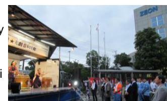
60th anniversary commemorative event

Members of the local community were invited to attend the event, and they joined in commemorating the 60th anniversary of the foundation of the R&D Center and the Kawasaki Plant, enjoying recreational activities and a drumming performance by employees.