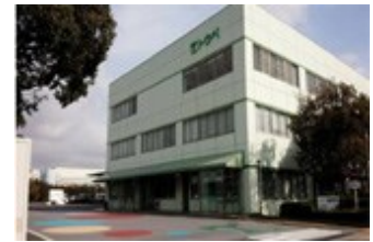
Tohpe Head Office

We were established as Toa Paint K.K. in 1915. We became a member of the Zeon Group in 2013. We manufacture, sell, and provide painting services for various types of paint, and operate a chemicals business based on acrylic rubber. We are participating in a project to manufacture powder paint in Vietnam, and are supplying stable quantities of products to the domestic market. We have been constructing a plant in Thailand to manufacture functional coatings, which is scheduled to begin operation this year.