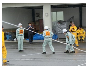
Fire-fighting hose operation competition