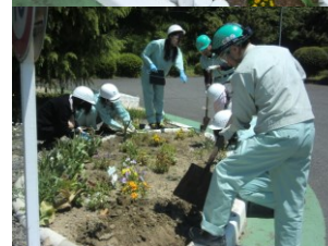
Greening campaign for plant grounds by growing "green curtains" led by the MD Committee