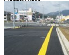
Road guidance markings for people with visual impairments