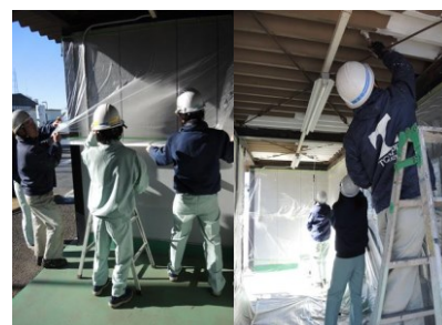
Improvement activities (cleaning and painting) led by the MD Committee