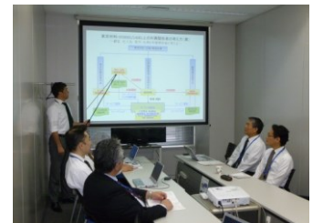
ISO Promotion Office working group meeting