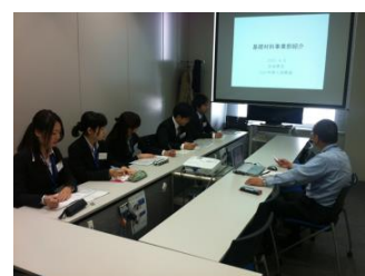
Training by division (New recruit education)

Staff with specialized technical expertise hold sessions for young employees and mid-career hires to deepen their technical knowhow, including basic properties of rubber and resins, and compound agents. Our goal is to arm our employees with technical expertise so that they can make proposals that accurately match customer needs.