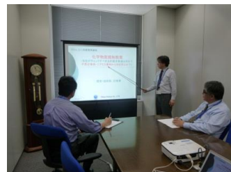
Chemical substances management system training at the Bangkok office

2. We continued employee training programs in fiscal 2014. Basic training on chemical substance regulations was conducted for all sales staff in Japan. Overseas, we provided training on China's Regulations on Safe Management of Hazardous Chemicals for employees at our affiliated companies in China.