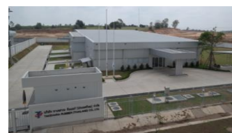
Rubber compound production plant in Thailand, established in collaboration with Takehara Rubber Co., Ltd.