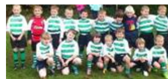
Barry Rugby Football Club's mini and junior teams

Barry RFC would like to thank ZCEL for their support of the local children and their contribution towards this success.