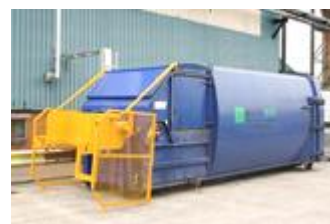
Waste compactor used in 2012 to improve waste control

The main objective in 2012 has been to improve waste control and ensure all waste streams are identified and segregated, helping us to find methods for elimination and outlets for recycling of this waste.