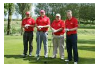
ZCEL Charity Golf Participants

ZCEL has supported its employees in taking part in a golf tournament to raise money for the Welsh Children's Cancer Charity LATCH. In addition, ZCEL provides work experience and placements to pupils from local schools and colleges.