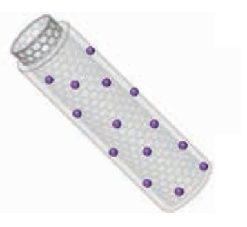
CG image of hybrid catalyst on single-walled CNT