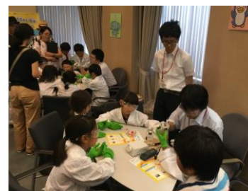
Omoshiro Taiken (fun experience) held in the summer of 2019

This event provides children with the opportunity to experience science and technology in a fun manner. Children are able to visually experience the processes by which the raw materials based on the chemical reactions that we use to produce resin. We are looking forward to participating in this event again if it is relaunched in the future.