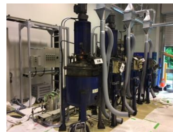
100m 3 prototype development room

We also make effective use of a prototype development room (100m 3 ) and laboratory (50m 3 ) at the Okayama Researchpark Incubation Center (ORIC) to develop prototypes of new types of electrical insulating materials, etc. The photo on the right shows a 200L mixing tank installation, which has been operational since October 2021.