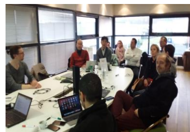
Product reviews at Three-Region Technology Meetings

We confirm the laws and regulations of various countries with our global subsidiaries, and are targeting product development and sales expansion to reduce environmental impact.