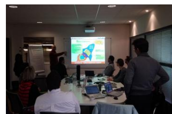
Taimatsu (Torchlight) activities conducted jointly by three regions