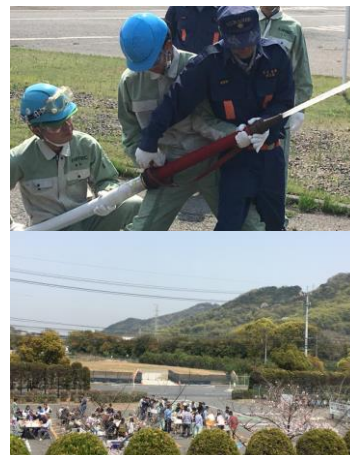
Firefighting training (top), cherry blossom viewing (bottom) in the spring of 2019

In the future, we plan to strengthen ties with everyone in the local community by holding get-together events using different formats.