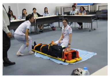
Victim transport training