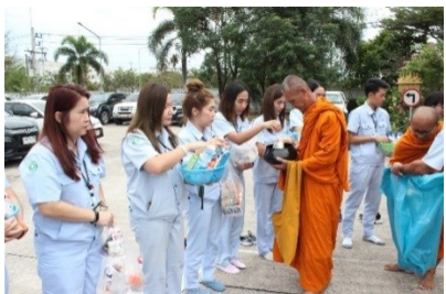
Donations to Buddhist priests