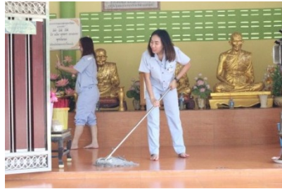
Volunteer clean-up activity at a local temples