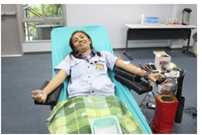
Collaborating on blood-donation activity