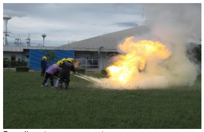
Our disaster response team undertaking firefighting training