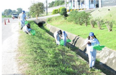
Cleanup around the plant