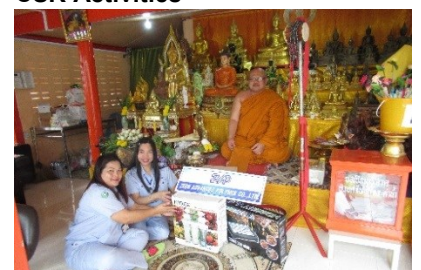
Donations to local temples