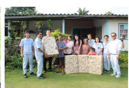
New Year's greetings to local residents