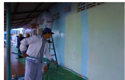
Volunteer painting work at local schools