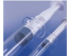
Medical device materials