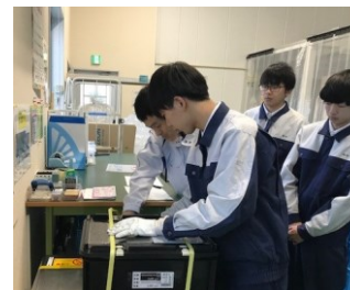
Internship (product packaging experience)

We cooperate with company tours and work experience programs for high school students through internships (three persons).