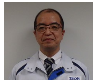
President Koji Minami

We provide products and services with safety first in the optical and bio markets with consideration for customers, a development mindset, and growth opportunities as key values.