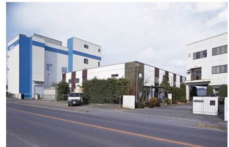
Zeon Opto Bio Lab Co., Ltd.

The predecessor of Zeon Opto Bio Lab, which was established in April 2019, was the Optes Inc. Sano Plant. Zeon Opto Bio Lab was established by spinning off the Sano Plant, which performs injection molding, from Optes, a subsidiary that performs manufacture of cycloolefin polymer (COP) processed products.