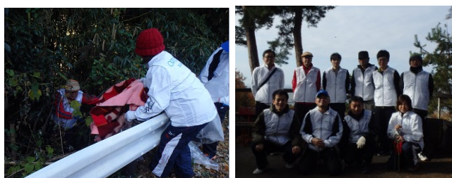
Karasawayama litter collection campaign (centipede squishing)