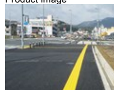
Road guidance markings for people with visual impairments