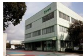
Tohpe Head Office