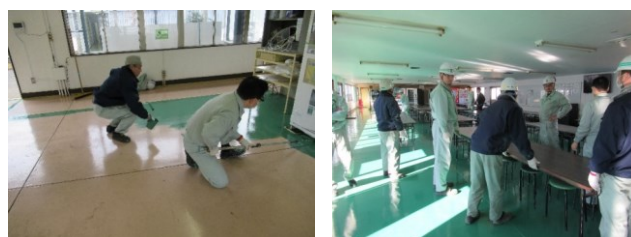
Improvement activities (cleaning and painting) led by the MD/Taimatsu (Torchlight) Activities