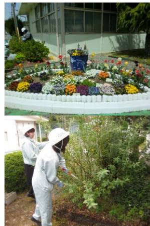
Greening campaign for plant grounds by growing "green curtains" led by the MD Committee