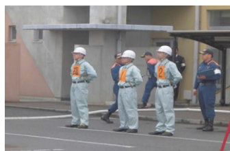
Fire-fighting hose operation competition