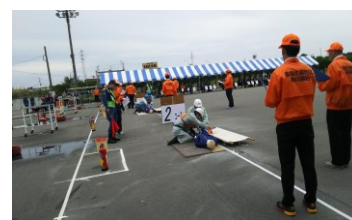
A disaster prevention association training competition