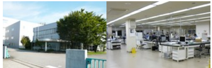
Zeon Medical's research center and plant