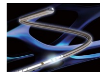
Intravascular pressure-sensing guidewire