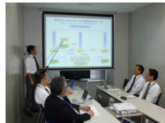
ISO Promotion Office working group meeting

Started to prepare manual to respond to standard revision in a working group. We are studying how to create a simple system that matches the business.