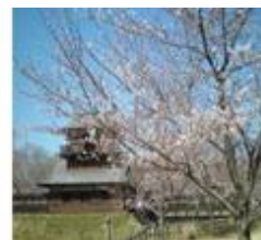
Cherry blossom at Sakasai Castle in Bando

The cherry blossom bloomed early in fiscal 2013 so the festival that year was held when the trees were in leaf. This year, however, the trees were in full bloom, and the both days were full of activity. We will also support this festival next year as we try to strengthen local connections.