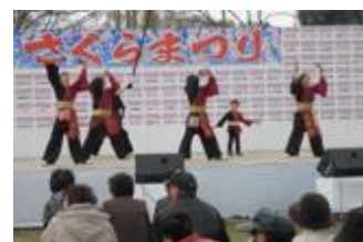
Cherry Blossom Festival