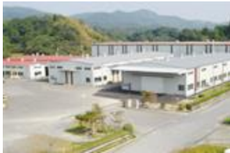
Zeon Kasei's Yamaguchi Plant

Powder compounds for one of the production methods for soft and thin skins, particularly for car interior or toys