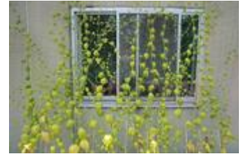
Green curtain at Ibaraki Factory

Moreover, at Zeon Kasei, we are abiding by our zero landfill goal, which we implemented at all of our factories in April 2011.