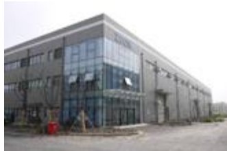
Zeon Kasei (Changshu) Co.,Ltd.