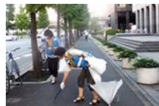
Tokyo Station Regional Joint Patrol

The Zeon Kasei Head Office has been participating in the joint patrol of the area surrounding Tokyo Station since November 2012 as a ZEON Group initiative. We collected garbage in the area surrounding Tokyo Station in April, September and the following February, making a total of three times in fiscal 2013. The garbage bags were completely filled after just one hour as a lot of garbage had been dropped in the middle of the streets, including plastic umbrellas and cigarette ends. We will continue to participate in this activity while we hope for manners to improve.