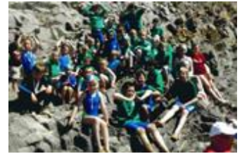
The Whitmore Bay Surf Life Saving Club activities

ZCEL has supported its employees in taking part in a golf tournament to raise money for the Welsh Children's Cancer Charity LATCH. In addition, ZCEL provides work experience and placements to pupils from local schools and colleges.