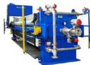
Liquid condensing equipment planned for on-site installation in 2014

Reducing our waste production has always been a high priority at ZCEL as we aim to reduce our environmental impact and at the same time increase our production efficiency. The main improvement activity in 2013 has been to reduce the total amount of waste emanating from plant effluents. The waste volume of plant effluents can be drastically condensed by removing moisture. In 2014, we will install new liquid condensing equipment, and the waste will be sent to external facilities for treatment after we reduce the waste volume.