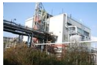
ZCEL U.K. plant