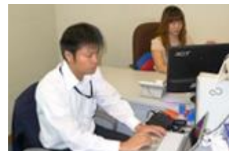
A trainee and a local staff member

In 2010 we launched a new training program to give employees an overseas immersion experience and develop their global competence. For three months starting in December 2011, we sent to a young employee in our Specialty Materials Sales Department to Singapore to learn the basics of our operations there and gain experience living in the local community and culture.