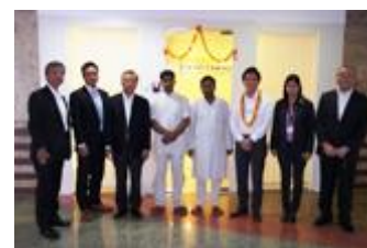
At the opening ceremony for Tokyo Zairyo India