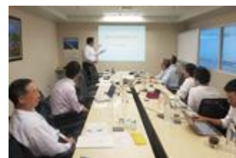
Statute training in the ASEAN representative office meeting