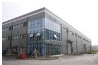
Zeon Kasei (Changshu) Co.,Ltd.