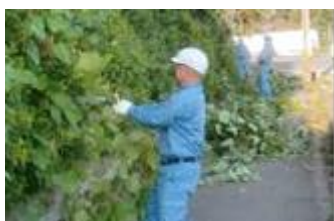
Prior to “Zero Weed Day”

The weather was nice on Zero Weed Day. Many employees turned out to remove weeds around the factory and tidy up. The area around the factory was visibly more attractive.