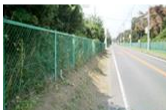
After “Zero Weed Day”