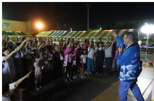
Summer festival held at Takaoka Plant

Zeon attaches great importance to our ties with local communities. Zeon's plants and Group companies hold various events, including summer festivals, and welcome opportunities to participate in community events.