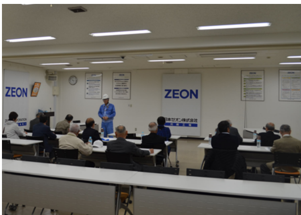
Responsible Care community dialog at the Kawasaki Plant We welcomed representatives of local residents' associations, and representatives of eight member companies of the Kawasaki district of the Responsible Care Committee.

Plants participate in community dialog as part of the Responsible Care Council activities and communicate information on environment-related improvements, safety, and disaster preparedness during plant tours for representatives of local government authorities and for community residents.