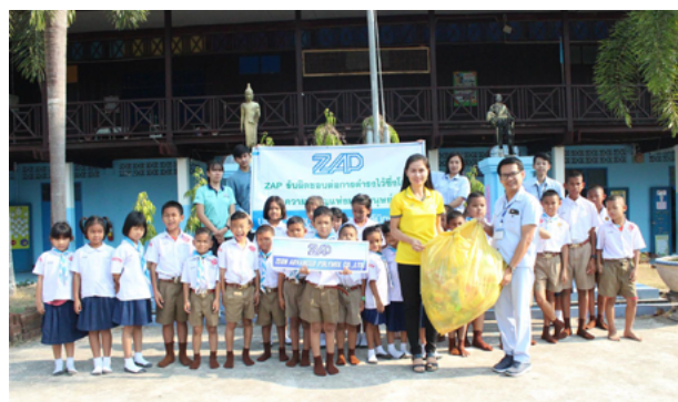
Thailand-based companies Zeon Advanced Polymix Co., Ltd. and Zeon Chemicals (Thailand) Co., Ltd. have conducted volunteer cleanups and charity activities for many years. The companies make donations to various groups including schools, nearby temples, hospitals, and educational institutions.