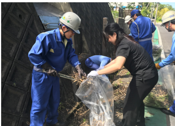
Every year, Zeon Polymix participates in the Lake Biwa Citizen Clean-up Activity organized by Otsu City.

With the goal of being useful to and benefitting local communities, Zeon's plants and Group companies conduct community cleanup campaigns around their sites and beyond.