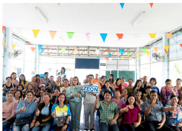
Community dialog activity undertaken by Zeon Chemicals (Thailand) Co., Ltd. in Thailand