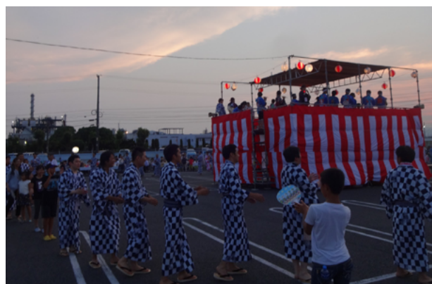
The Tokuyama Plant sponsors the Zeon Waraku Odori Dance Festival