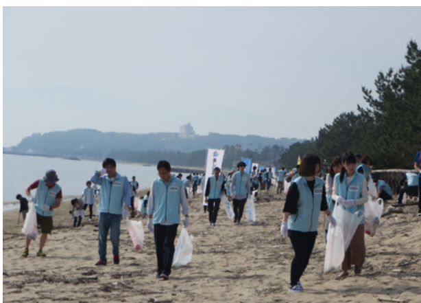
Many employees from Takaoka Plant, Optes, Zeon North, and Zeon Medical participate in coastal clean-up activities.