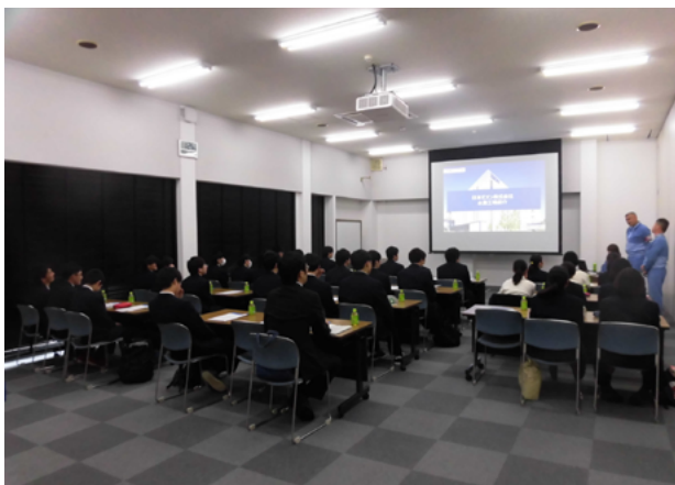
Mizushima Plant: plant tour

Zeon's plants and Group companies offer assistance to educational institutions with internships for high school, technical college, and university students, by welcoming plant tours by school groups, and by sending special instructors to give lessons at schools.