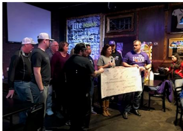
Zeon Chemicals L.P. (ZCLP) in U.S.A. has conducted volunteer activities and donation drives for many years.

We engage in collaborative activities with local communities in each region.