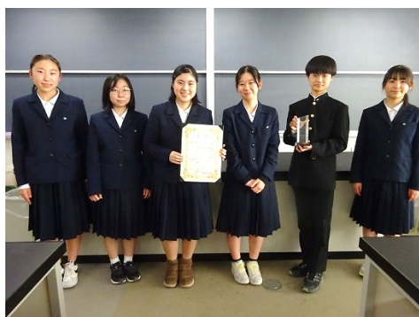
Members of the Super Science Club of Toyama Chubu Senior High School