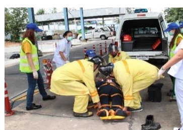
Safety Talk in progress