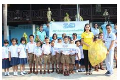
Donations to local schools