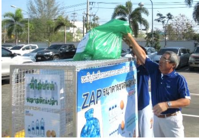
Collection of used plastic bottles