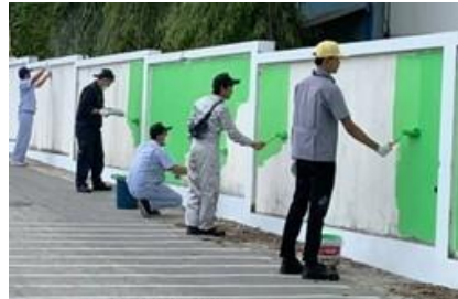
Volunteer painting work at local schools