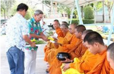
Donations to Buddhist priests