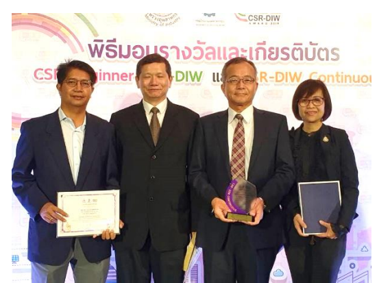
CSR-DIW Award Ceremony/ CSR-DIW Award Ceremony Attendees