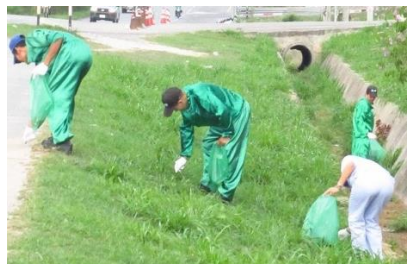
Cleanup around the plant