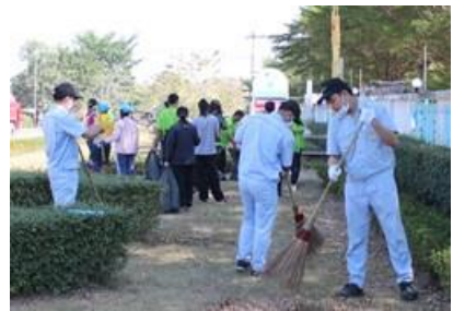
Volunteer clean-up activities at nearby public facilities