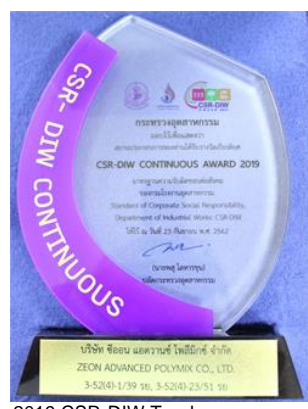
2019 CSR-DIW Trophy

ZAP received the CSR-DIW 2019 Award from Thailand's Department of Industrial Works (DIW), the third consecutive year since 2017.