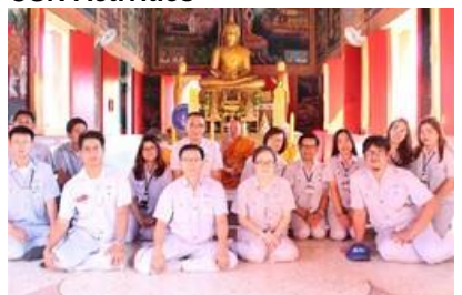
Donations to local temples