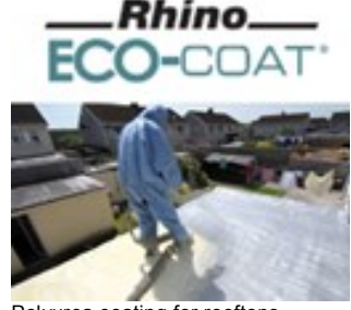
Polyurea coating for rooftops Eco-Coat