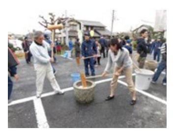
Participation in Honjo district mochi (sticky rice cake) pounding event and market