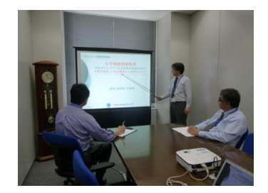
Chemical substances management system training at the Bangkok office