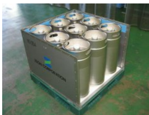
Top lid and one side board removed