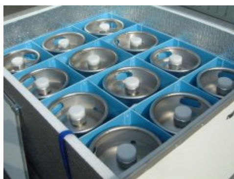
Interior of a container

Container for up to nine 40-liter canisters