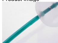
Offset balloon catheter for the digestive system