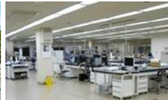
Zeon Medical's research center and plant