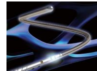
Intravascular pressure-sensing guidewire