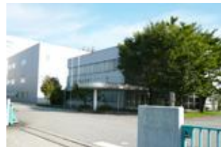
Zeon Medical's research center and plant

Hiring in FY 2019: 21 (11 men, 10 women)