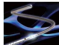
Intravascular pressure-sensing guidewire