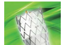
Covered metallic stent for bile ducts