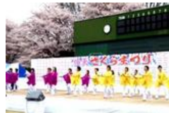
Cherry Blossom Festival

The cherry blossom bloomed early in fiscal 2013 so the festival that year was held when the trees were in leaf. This year, however, the trees were in full bloom, and the both days were full of activity. We will also support this festival next year as we try to strengthen local connections.