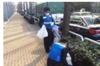
Tokyo Station Regional Joint Patrol

The Zeon Kasei Head Office has been participating in the joint patrol of the area surrounding Tokyo Station since November 2012 as a Zeon Group initiative. We collected garbage in the area surrounding Tokyo Station in July and the following March, making a total of two times in fiscal 2014. The garbage bags were completely filled after just one hour as a lot of garbage had been dropped in the middle of the streets, including plastic umbrellas and cigarette ends. We will continue to participate in this activity while we hope for manners to improve.