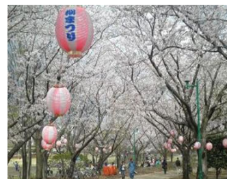
Cherry blossoms on both sides of the road from the park to the stadium