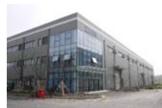
Zeon Kasei (Changshu) Co.,Ltd.