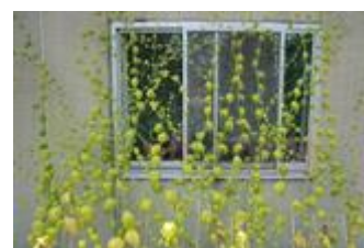
Green curtain at Ibaraki Factory

From fiscal 2012, we grew a green curtain at the office building of the Ibaraki Factory as a part of our summer energy conservation measures, which we also implemented at the Yamaguchi Plant in fiscal 2013. In fiscal 2014, we have implemented these again at both plants. We planted bitter melon and Ryukyu morning glory in planters and tended them with care. We are reducing our air conditioner usage and therefore our power consumption as the green curtain shades the building from the sunlight. In addition, caring for the plants helped raise employee consciousness of saving electricity and also their eco-awareness. Moreover, at Zeon Kasei, we are abiding by our zero landfill goal, which we implemented at all of our factories in April 2011.