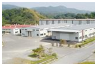
Zeon Kasei's Yamaguchi Plant

Powder compounds for one of the production methods for soft and thin skins, particularly for car interior or toys.