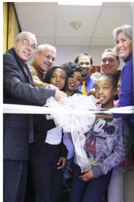
Tape-cutting ceremony for new IT equipment sponsored by ZCLP

ZEON Chemicals has continued the annual tradition of a Holiday Charity program that provides funding and donations from the company and employees toward a selected charity. In 2011 the charity was the Salvation Army. The company and employees provided contributions of clothing, toys and money for over 100 families.