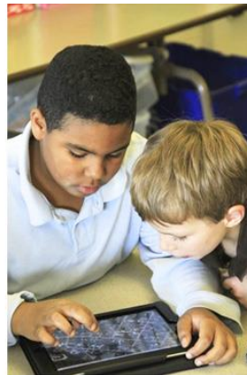
"iPad Lab" held as part of an IT equipment support program